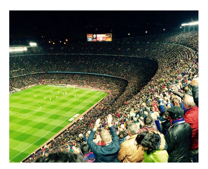
El Clasico at Camp Nou

"Football is the great global game, endlessly discussed and debated but never yet scrutinised extensively through the lens of design. So this exhibition is an exciting and important one for the museum but also, I hope, for the game itself. Equally important is the chance to engage with new audiences, to reach out to people who have never felt that museums were for them."