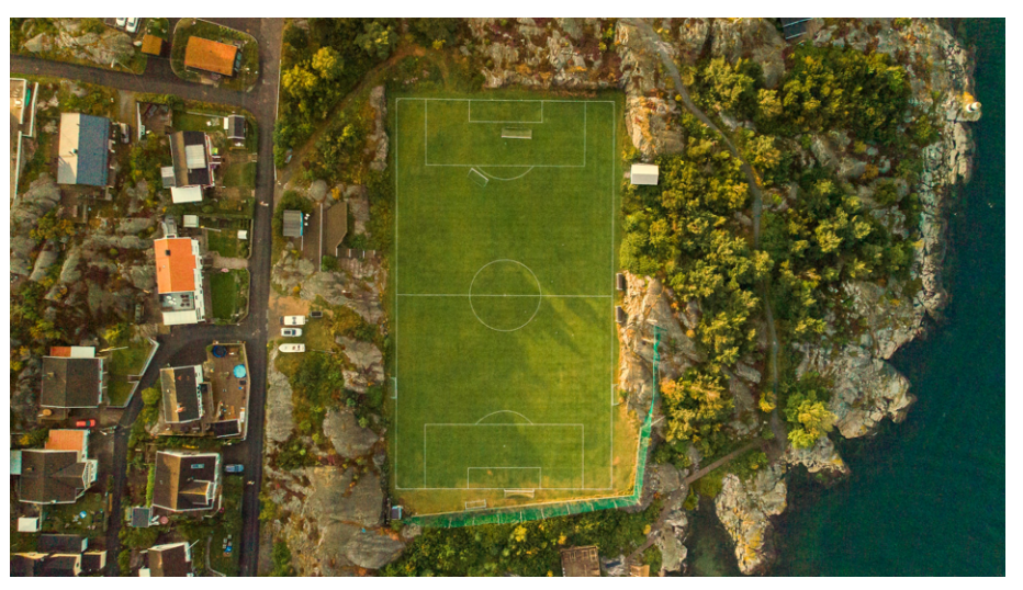
Aerial view of a football field.