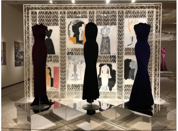
Left; Black silhouettes. Right; Renaissance perspective