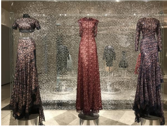
Left; Sculptural tension. Right Decoration and structure