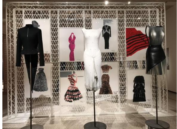
Left; Fragility and strength. Right; Timelessness.