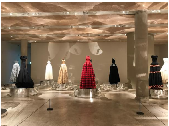
Left; Revolutionary skills. Right; Exploring volume