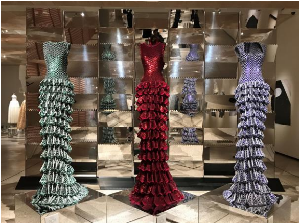
Left; Other places, other cultures. Right; Spanish accent