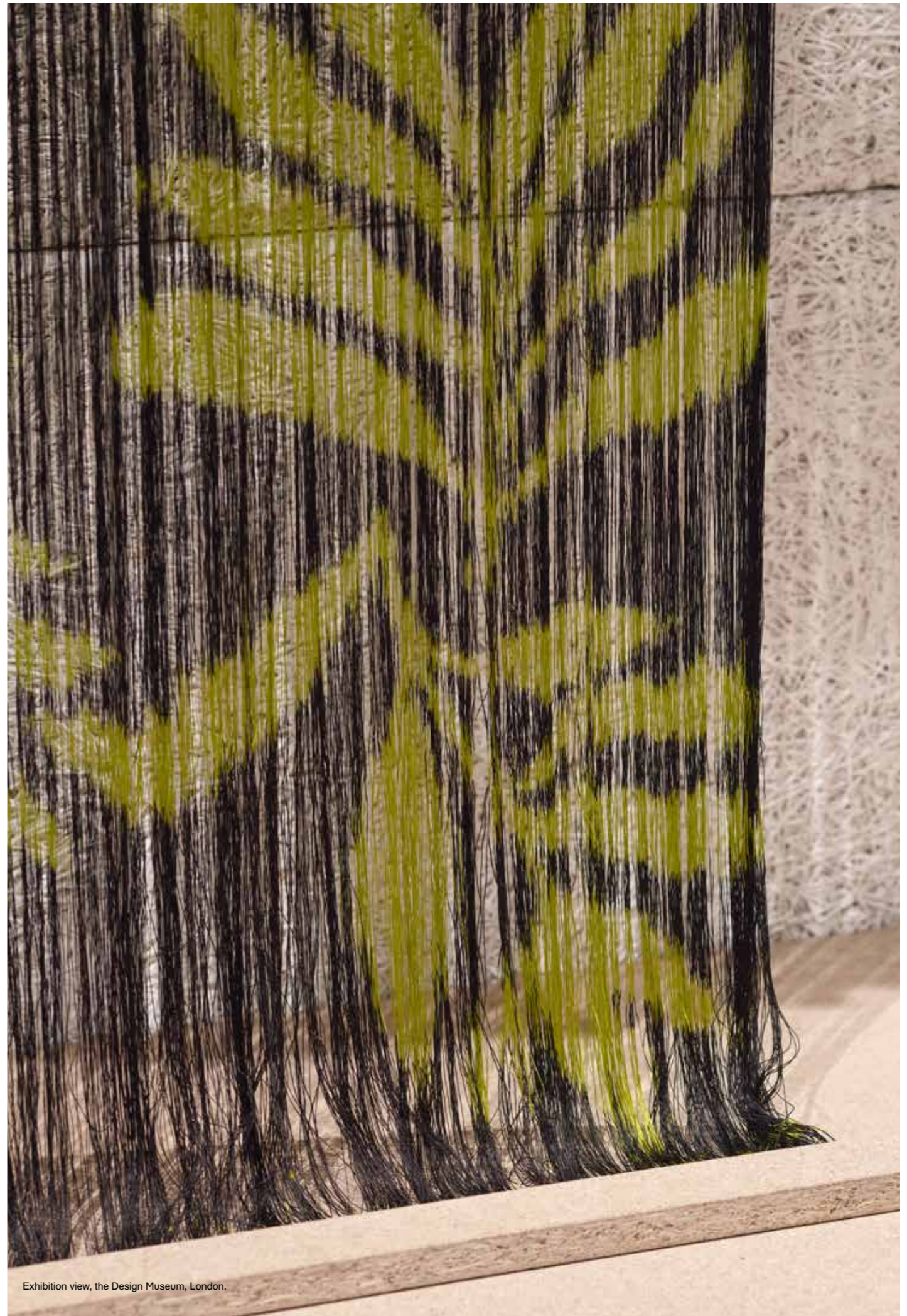
Exhibition view, the Design Museum, London.